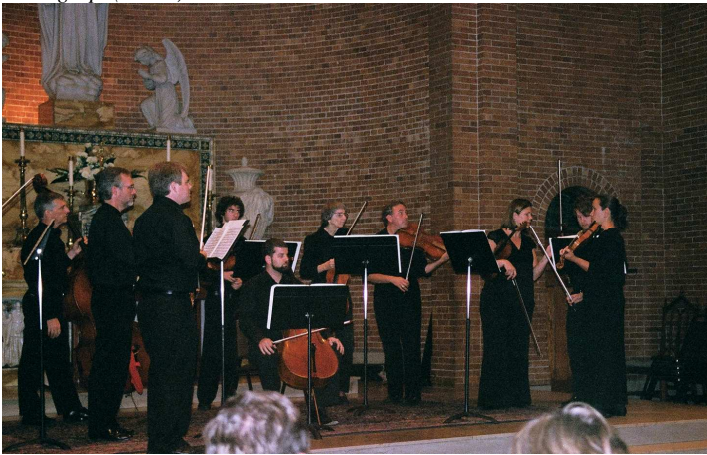
Photograph(below): Tallis Chamber Orchestra