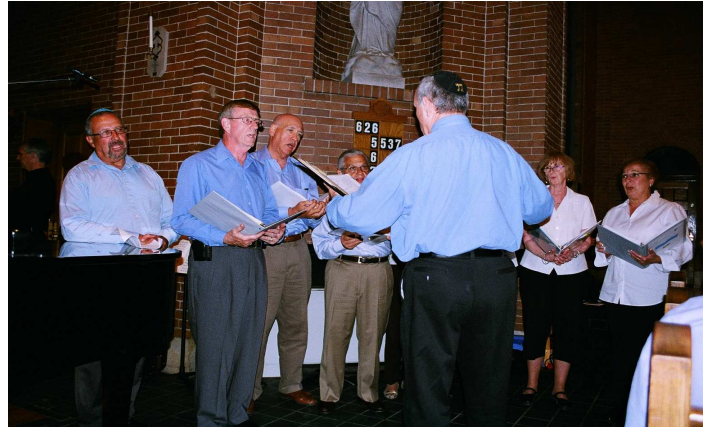
Photograph(above): B'nai Israel Kavanotes