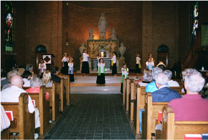
Photograph(above): St. Mary Liturgical Dancers